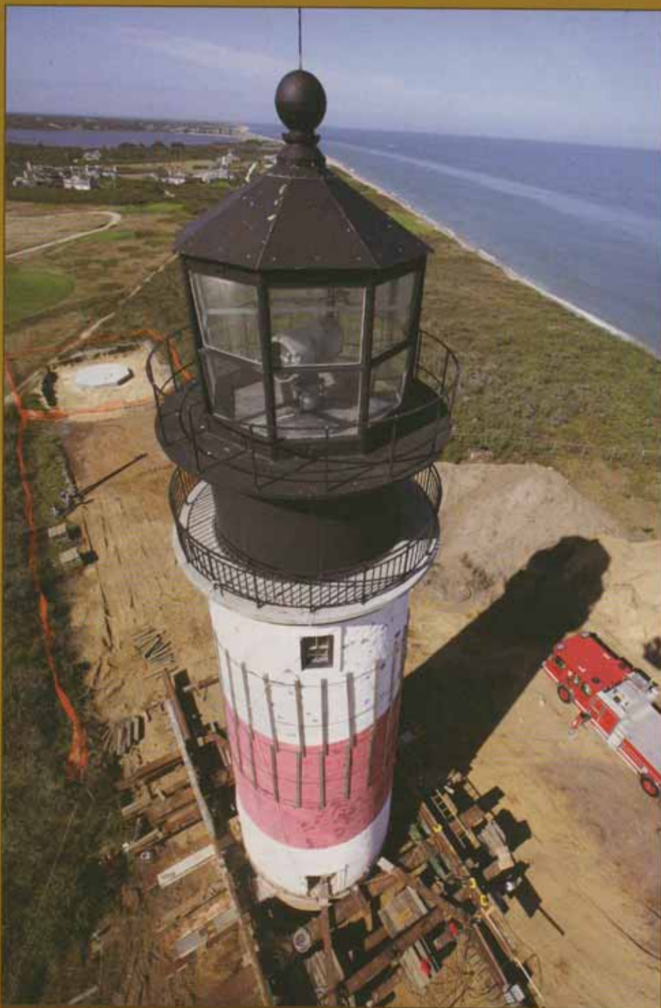
Sankaty Lighthouse "On the Move" as seen from atop the Nantucket Fire Department's Ladder Truck.

A project as big as this takes the dedication and commitment of a large number of people who have taken a major risk to save an important part of America's maritime history and they are to be congratulated and supported.