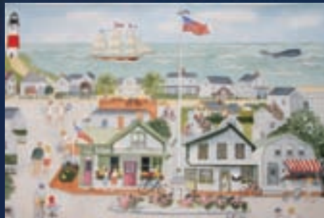
2010 Susan Ried Watercolor

For additional tickets, call (508) 228-9917