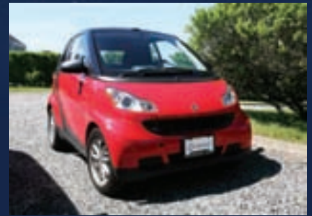
smartcar donated by smartUSA, smart: A Daimler Brand® and by two anonymous generous donors