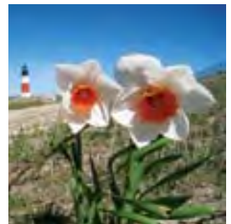
Sankaty Light Daffodil