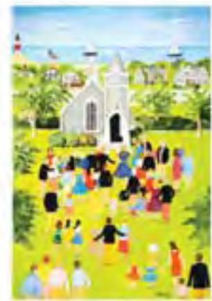
The 'Sconset Trust 1984-2011

Cocktails and hors d'oeuvres provided at your home, by the 'Sconset Trust Board members. Offered in August 2011 or July 2012.