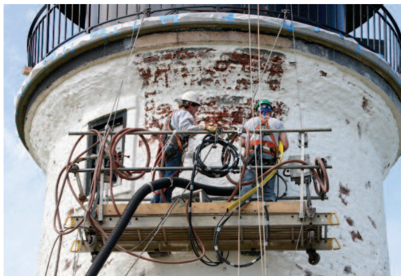
Cut line cutline

Volunteers Needed for SANKATY HEAD LIGHTHOUSE Open Days Saturday, October 11th & 12th Call the Trust at 508 228 9917 for details.