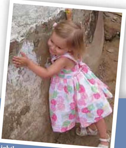
Lighthouse Bon Voyage

Parking will be limited, police and volunteers will be on hand to direct you. If possible, arriving at the site via bike or foot is the best option.