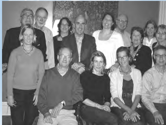
At right 'Sconset Trust board meeting in New York