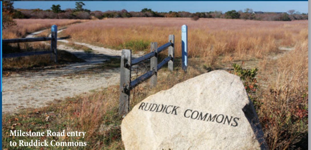
Milestone Road entry to Ruddick Commons

Land Report Board of Directors Trust Holdings Map Night under the Light Gala Executive Director's Letter New Board Members Lighthouse News Preservation News Daffodil News Save the Date