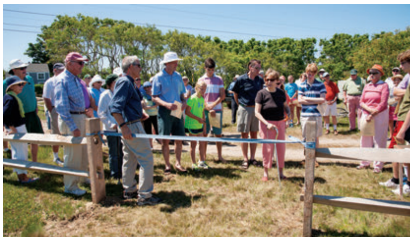
Ruddick Commons Grand Opening Celebration Saturday, June 28, 2014