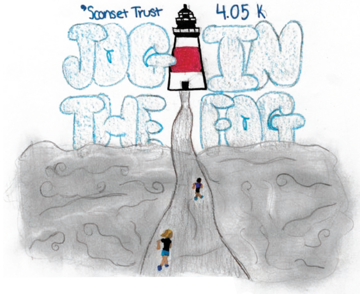
T-shirt design by Clare Baurmeister