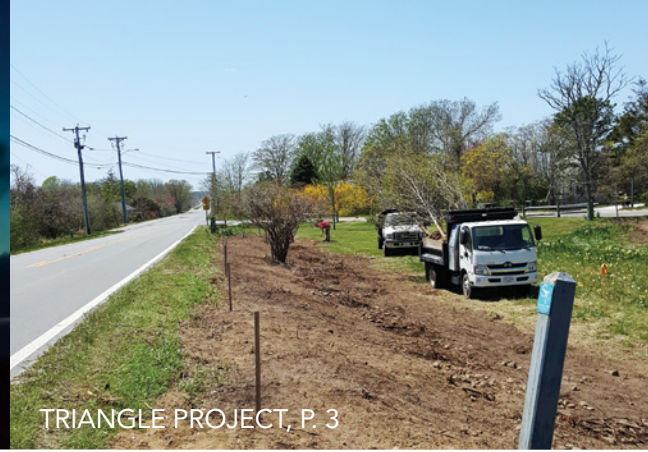
TRIANGLE PROJECT, P. 3