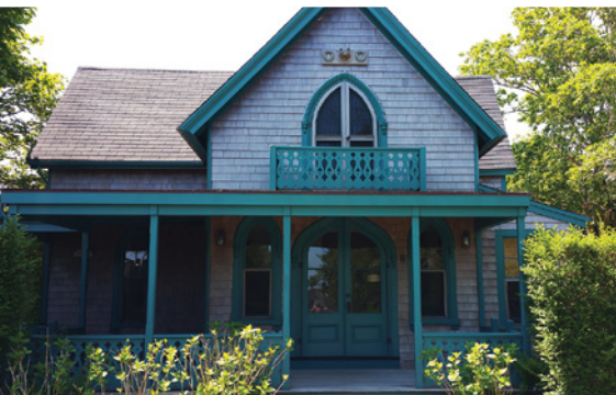
8 Cottage Street