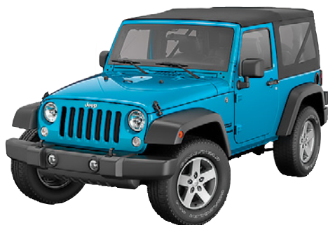
2015 JEEP WRANGLER SPORT S 4X4

1 TICKET $100 4 TICKETS $250 25 TICKETS $1000 2 TICKETS $150 10 TICKETS $50