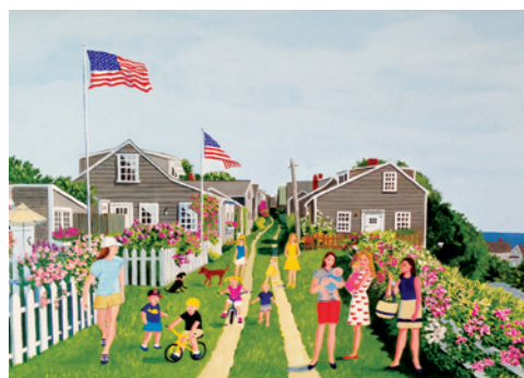
2015 SUSAN RIED PRINT "FRONT STREET"