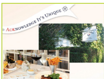
DINNER AT THE CHANTICLEER