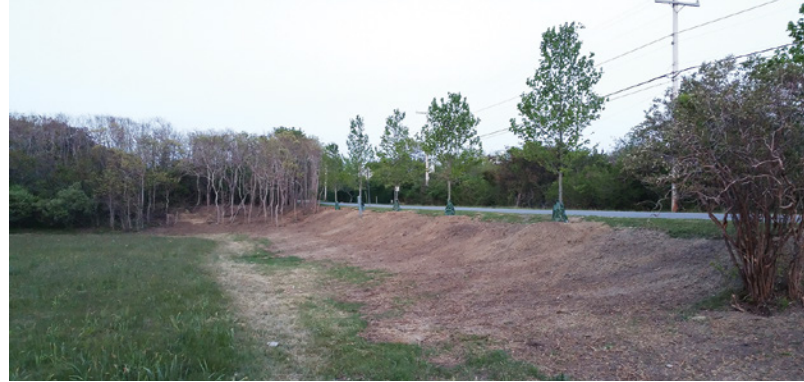
The top image shows the project in process, the bottom image with the maple trees in place on the Main Street side.