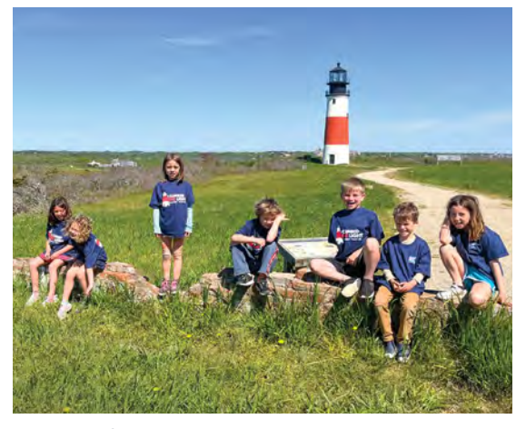
Students from the Lighthouse School on a visit Sankaty this past summer.

Among other work, the crew is focusing on restoring the lantern housing and its railing, the gallery deck railings and floor, the ships ladder and, importantly, all the windows in the lighthouse. The spiral staircase will be spongeblasted and recoated, and the anchor that stabilizes the staircase will